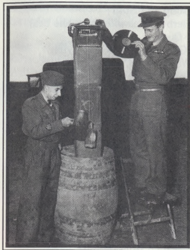
Music-hungry RAF personnel in North Africa rig up a water-powered record player.